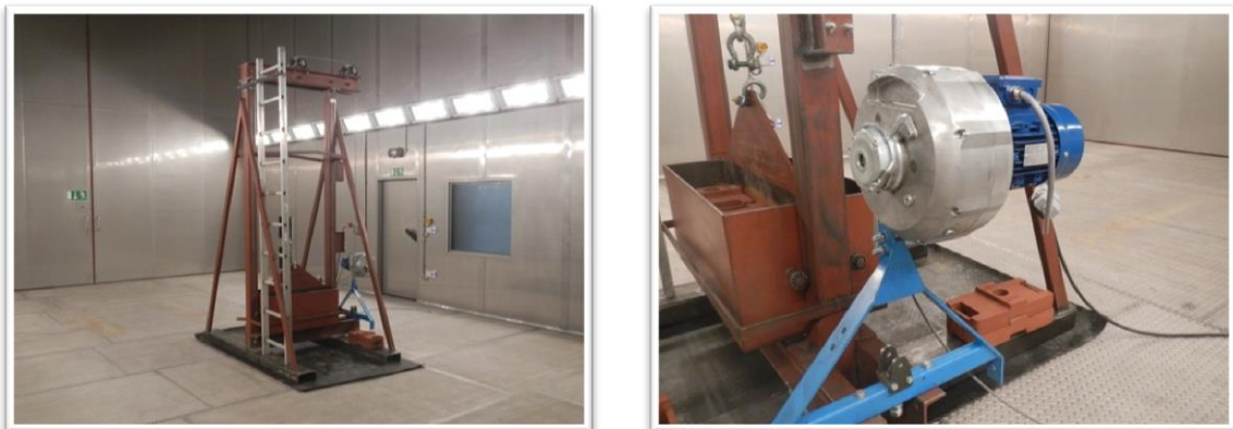
Figure 5: Service cage hoist test set-up in climatic test chamber

With regard to operational safety, special attention must be paid to the safety brake system, among other things. Mechanical hoists used for service cages located in the turbine tower also need to be modified for safe cold weather operation, as the cold causes cables to become brittle. In most cases no heating is installed in the tower section, making this component vulnerable to cold temperatures in wintertime. Special attention needs to be paid to this equipment to ensure nacelle accessibility under all conditions for maintenance and to ensure that work can be reliably performed via the service cage.