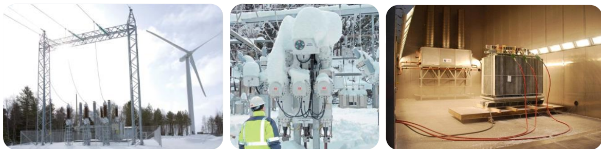
Figure 6: Cold-climate wind farm – grid infrastructure and transformer testing at OWI-Lab

Not only can mechanical components be affected by temperature, electrical parts located in a wind turbine, such as transformers, generators, converters, cables, switchgear and other electrical grid infrastructure, can also be affected if not properly taken into account. The distribution transformer, for example, is an essential component in the wind turbine layout. If this component fails or does not work properly, it can cause prolonged downtime and associated losses. These components often have long delivery times due to batch production. It can cost €25,000 to €40,000 to replace a 1MW to 2.5 MW transformer, but the downtime cost of the turbine due to long delivery times can be much higher. Delivery times of three months are not unusual, causing \pm €100,000 in downtime costs in the same power range. This case study makes it clear that the failure of such an electrical component can lead to high O&M costs. It is therefore essential that such equipment is suitable for all operational conditions, including extreme temperature events.