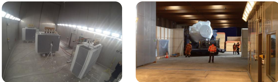
Figure 12: Simultaneous transformer testing and multi-MW gearbox testing at OWI-Lab

OWI-Lab's test facility is located at one of the break-bulk terminals in the port of Antwerp. Housing a 10m x 8m x 7m (LxHxW) climatic chamber and the ability to handle machinery of up to more than 150 tonnes in size on the quay directly from ship, train or lorry is a real asset when serving international customers. The laboratory also houses a test bench for the cold-start testing of rotating wind turbine machinery, as well as an energy supply for functional testing of electrical equipment (50Hz, 60Hz, different powers, voltages and currents). Temperature testing ranging from -60 °C to +60 °C is possible, as is humidity and IR radiation testing. Also, the testing can be monitored remotely by the use of an IP camera, thermal camera (FLIR) and dedicated data acquisition tools and analysis software (NI). The large testing space makes it possible to test multiple systems simultaneously under the same test conditions. Simultaneous testing can be useful for benchmarking the results of changes, modifications and different versions of machinery under the same climatic conditions.