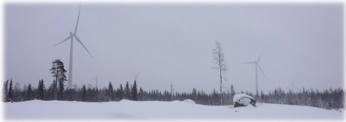
Figure 2: Cold climate wind farm in Sweden

While the vast majority of wind turbines are located in moderate climates, a rising number of wind turbine assets are being installed in challenging and remote locations, such as offshore, in subarctic locations, in the mountains or in deserts. Since these locations often have good, stable winds and are sparsely populated, they are ideal locations for installing large numbers of wind turbines. For such applications, it is necessary to develop appropriate and dedicated specifications for turbines and components.