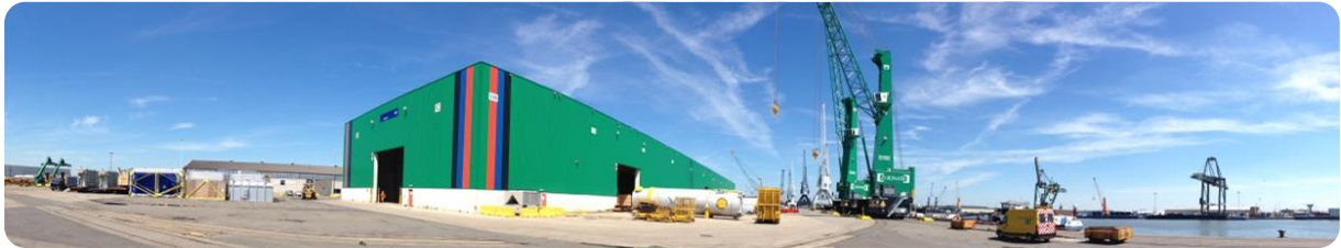
Figure 11: OWI-Lab's climatic test facility

OWI-Lab's test facility is located at one of the break-bulk terminals in the port of Antwerp. Housing a 10m x 8m x 7m (LxHxW) climatic chamber and the ability to handle machinery of up to more than 150 tonnes in size on the quay directly from ship, train or lorry is a real asset when serving international customers. The laboratory also houses a test bench for the cold-start testing of rotating wind turbine machinery, as well as an energy supply for functional testing of electrical equipment (50Hz, 60Hz, different powers, voltages and currents). Temperature testing ranging from -60 °C to +60 °C is possible, as is humidity and IR radiation testing. Also, the testing can be monitored remotely by the use of an IP camera, thermal camera (FLIR) and dedicated data acquisition tools and analysis software (NI). The large testing space makes it possible to test multiple systems simultaneously under the same test conditions. Simultaneous testing can be useful for benchmarking the results of changes, modifications and different versions of machinery under the same climatic conditions.