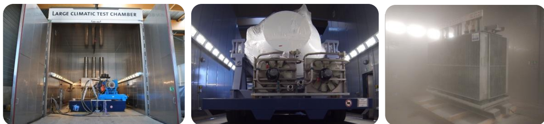
Figure 1: OWI-Lab large climatic test chamber, gearbox test and transformer test

Since inaugurating the chamber in 2012, OWI-Lab has served many well know companies in the sector and has become a full-service provider for the testing of large electrical and mechanical wind turbine equipment. Depending on the certification process and scope of the project, testing is typically witnessed either by the customer or by external parties to check the performance of equipment under conditions ranging from -60 °C to +60 °C, sometimes under load and sometimes not (For example: no-load start-up test of a gearbox or storage test of a transformer for ).