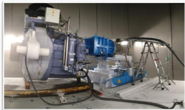
Figure 4: Nacelle cooling affected by snow and ice. Gearbox test bench in OWI-Lab climatic test chamber.

A wind turbine's pitch and yaw system can also be affected by cold temperatures, which means special attention must be paid to the behaviour of viscous hydraulic oils and the seals in order to prevent leakage. Due to their proximity to the outside environment, these systems are more vulnerable to extreme cold than the other electromechanical components in a wind turbine.