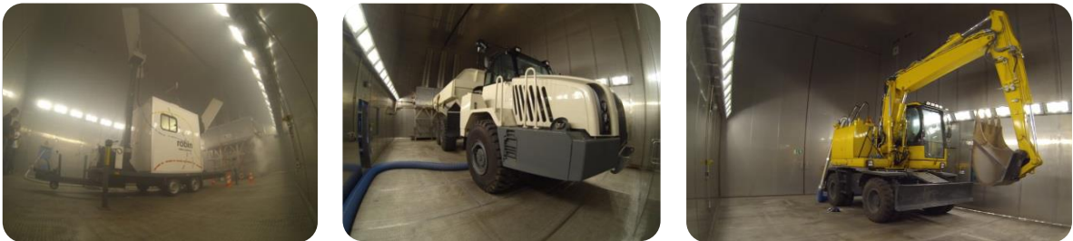
Figure 10: Bird radar system, arctic dump truck and wheeled excavator being tested at OWI-Lab’s climatic test facility

It is not only the wind turbines themselves that suffer from extremes. Looking at the whole value chain of wind energy projects, from ‘environmental impact study’ to ‘project development’ and on to construction, operation and maintenance, all equipment can undergo cold temperatures when the scope includes cold-climate sites. Early last year, a mobile bird radar system was tested at OWI-Lab and approved for service at -20 °C. On the other hand, performance was also tested for hot areas with high humidity. The trailer-mounted bird-radar system is used for bird migration research and risk assessment for bird impacts during the environmental impact assessment phase of a wind farm project. Other off-highway machinery – used either in the construction phase (dump trucks, wheeled excavators, cranes, etc.) or in the maintenance phase (snowcats, dozers, tracked service vehicles, etc.) of a wind farm – is tested in the laboratory to ensure reliable operation under all conditions.