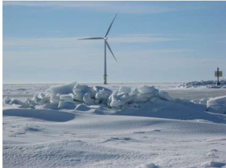
Figure 3: Operational and survival limits in cold climates (as per GL) and picture of ‘Pori Offshore 1’ an offshore cold climate turbine

according to Gemeinsamer Lloyd Industrial Services GmbH, 2011, „Certification of Wind Turbines for Extreme Temperatures“ except*