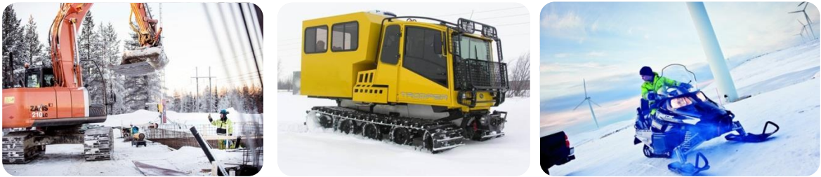
Figure 9: Example of construction and O&M tools for cold climate wind energy projects

It is not only the wind turbines themselves that suffer from extremes. Looking at the whole value chain of wind energy projects, from ‘environmental impact study’ to ‘project development’ and on to construction, operation and maintenance, all equipment can undergo cold temperatures when the scope includes cold-climate sites. Early last year, a mobile bird radar system was tested at OWI-Lab and approved for service at -20 °C. On the other hand, performance was also tested for hot areas with high humidity. The trailer-mounted bird-radar system is used for bird migration research and risk assessment for bird impacts during the environmental impact assessment phase of a wind farm project. Other off-highway machinery – used either in the construction phase (dump trucks, wheeled excavators, cranes, etc.) or in the maintenance phase (snowcats, dozers, tracked service vehicles, etc.) of a wind farm – is tested in the laboratory to ensure reliable operation under all conditions.