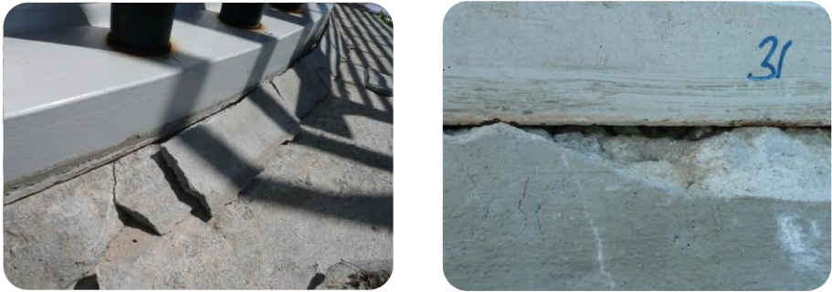
Figure 8: Foundation damage caused by extreme temperatures (as per GL)

With regard to laboratory testing, climatic test chambers can be used to perform thermal ageing and thermal cycling tests to check the behaviour of new grouted materials and foundation designs. The effect of humidity and freeze/thaw cycles can also be tested in real life.